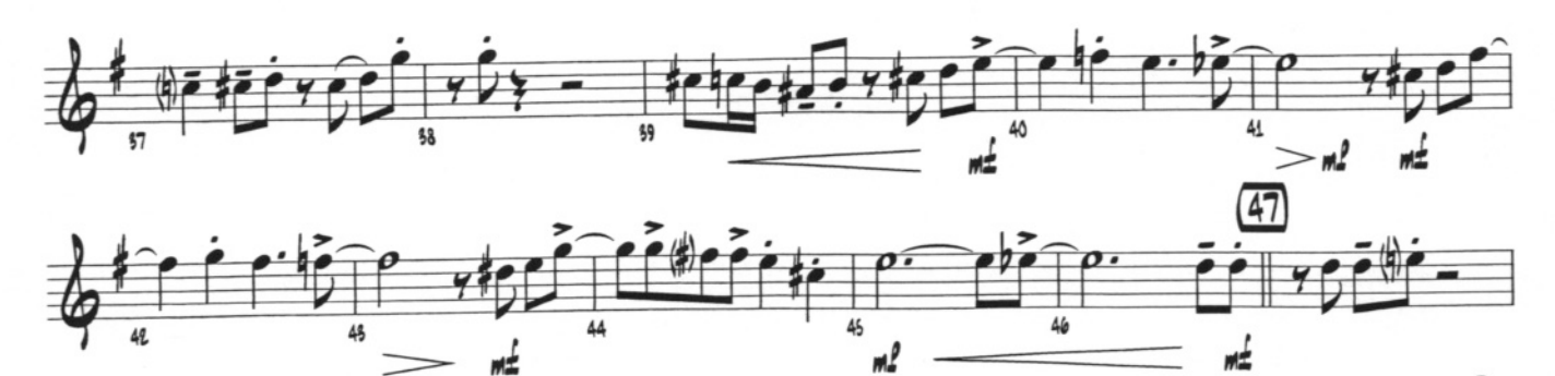
© 1956 (Renewed) ST. NICHOLAS MUSIC, INC. This Arrangement © 2015 ST. NICHOLAS MUSIC, INC. All Rights Reserved including Public Performance Used by Permission